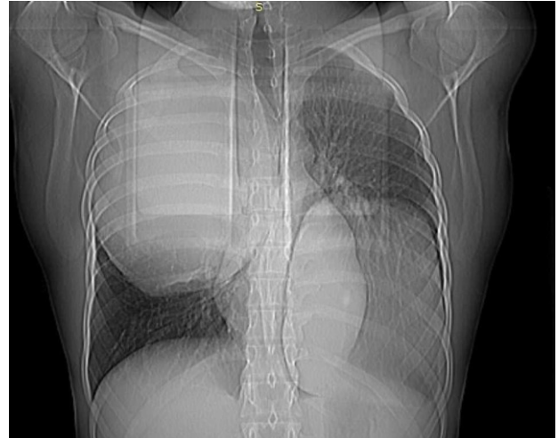
Figure 1: Plane chest X-ray (posteroanterior view) showing bilateral large homogenous well-defined opacity.

The patient received a preoperative dose of 400 mg intravenous ciprofloxacin, as per the hospital's protocol.