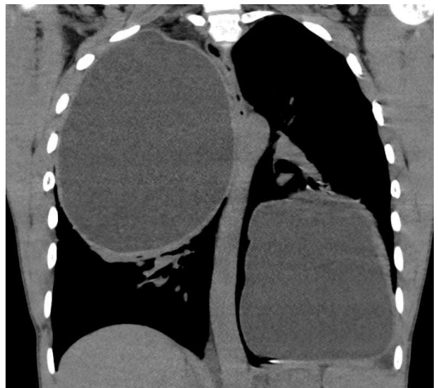
Figure 2: computed tomography scan of the chest (coronal view) showing two giant hydatid cysts on both sides of the chest.

The surgery was performed under general anesthesia. Positioned laterally on the left with a single lumen endotracheal intubation, a 5 cm utility incision was made in the fifth intercostal space, located in the posterior axillary line. Additionally, a 1 cm incision was made in the sixth intercostal space, anterior axillary line, to accommodate the camera. For the right-side cyst, a controlled evacuation was executed post-isolation with packs soaked in hypertonic saline. The germinal membrane including the daughter cysts and pericysts was removed, the fistulae were closed, and the residual cavity was rinsed with hypertonic saline and closed by 2-0 vicryl (Figure 3). A chest drain was inserted. The same procedure was repeated for the left-side cyst within the same session (Figure 4).